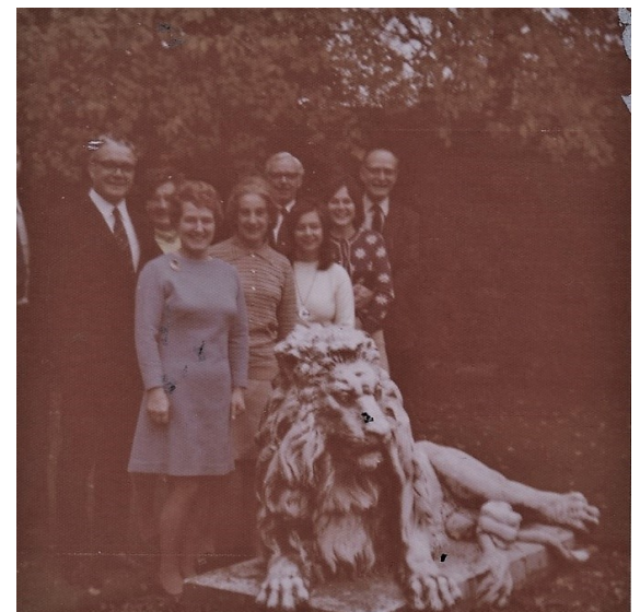
The lion, with members of the Sunbury UDC, at Benwell House in Green Street in 1973.

and horses. The Latin inscription at the top read "Dulce et decorum est pro patria mori": "It is sweet and fitting to die for one's country", a sentiment which fell into disuse after the carnage of the First World War.