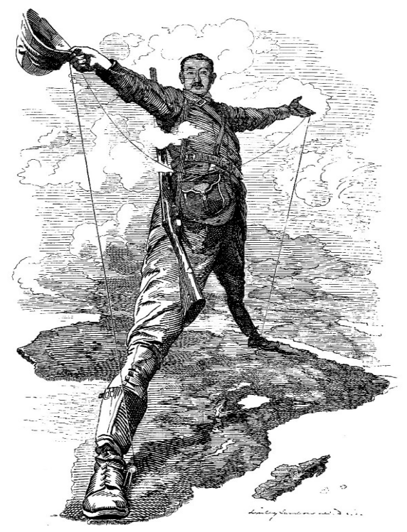
The 'Rhodes Colossus' - Cecil Rhodes bestriding Africa. A 'Punch' cartoon of 1892.

clashes, although the occasional incident such as that at Waiima where Edward Lendy died, did happen. As a result, by 1914, almost 90% of Africa was under European control.